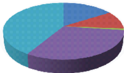
2010/11 Forecast Block Grant Departmental Breakdown